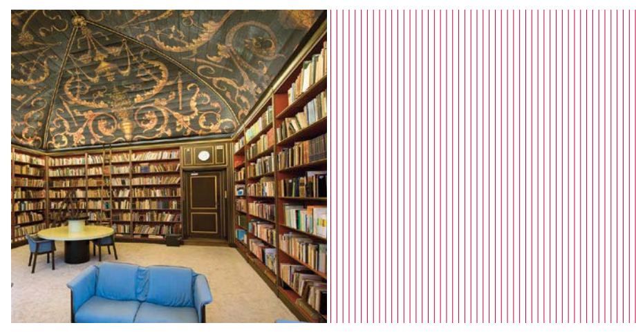
01 Readingroom at the Senate

The topic of the unwanted increase in European agencies is a matter of concern to European citizens. As there is often no detailed explanation of the added value of extra European structures, questions and doubts arise. When the principles of subsidiarity and proportionally are applied to the establishment of new agencies, the answer is often negative. The Senate is against the creation of additional bureaucracy before steps have been taken to improve the existing structures.