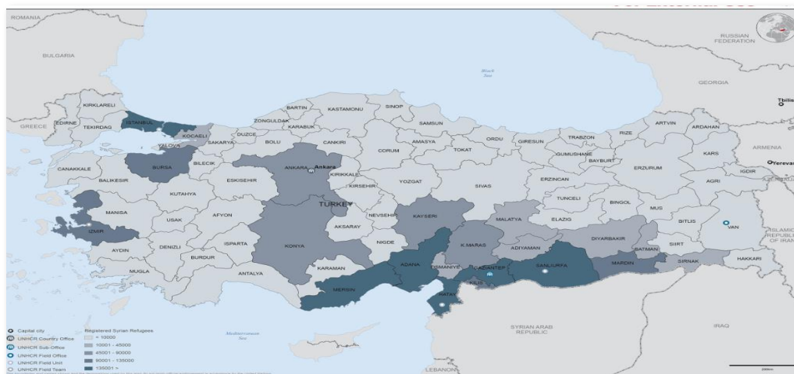
Provincial Breakdown of Syrian Refugees in Turkey, Source: UNHCR, December 2016

Turkey's geographical position makes it a prominent reception and transit country for many refugees and migrants. As a result of an unprecedented influx mainly due to the Syria conflict, the country has been hosting the highest number of refugees and migrants in the world, numbering more than 3 million. It includes 2.8 million registered Syrian refugees of which 10% reside in 26 camps established by the Turkish government in the south-east of Turkey, while the remaining 90% live outside of camps in urban, peri-urban and rural areas. To receive and host such high numbers of refugees and migrants, Turkey has been providing generous humanitarian and financial support.