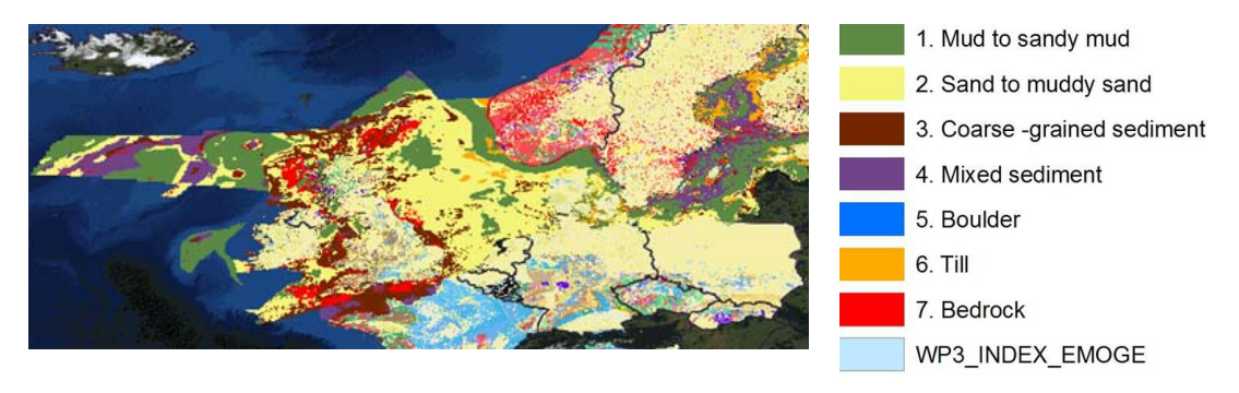
Figure 3 Sediment layers produced by the geology thematic assembly group (The land areas use the OneGeologyEurope classification)

Another example is the sediment data layer produced by the thematic area group for geology (Figure 3). This is the first time that such a data layer has been produced for marine sediments. The first stages of planning a cabling or pipe-laying operation across the North Sea can now use a set of data that is consistent for the waters of all the coastal states. Furthermore the marine data is perfectly consistent with the land data which facilitates the task of coastal zone management.