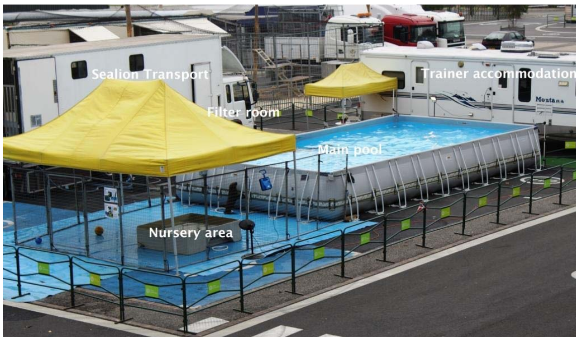
Figure 1 Typical sea lions facilities (pool size: about 50.000 liters; 1.2 m deep) (reprinted with permission)

The animals mostly live in small (n < 5) stable family groups and are fed about 6 kg of good quality fish per day by hand in several portions (e.g. 3-4 times).