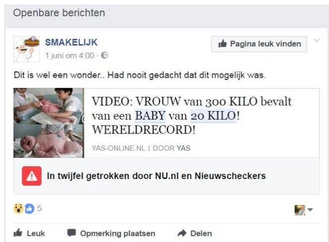
Figure 2: “Detected and eliminated” fake news, with a warning issued by NU.nl and Nieuwscheckers.

political figures in interviews in newspapers or TV shows. There are also websites such as Hoaxmelding.nl and Nieuwscheckers.nl that compile lists of instances of false news on Facebook and elsewhere. For their study of disinformation, Rathenau researchers analyzed these lists, comprising respectively 140 on Hoaxmelding (collected between 1 February 2014 and 18 December 2017) and 166 on Nieuwscheckers (between 3 February 2017 and 5 January 2018) (van Keulen et al., 2018). They found that the items on the list of Hoaxmelding involved examples of unfounded warnings (65), polarizing disinformation (32) and fake crime news (31). Additionally, there were several examples of clickbait, benign as well as malicious. The content steers users to advertising, “like-farming” and phishing sites (van Keulen et al., 2018: 38). Such posts contain human interest stories that are “painful on a personal level” (van Keulen et al., 2018: 45). The researchers found that only 25% of the disinformation concerned political content and most clickbait serves a commercial goal, rather than a political one. On the list of items collected by Nieuwscheckers, the Leiden University-based initiative, less than half was found to have political content. Within the full set, the researchers found six examples of polarizing content. Otherwise, many of the posts concern factually incorrect, public statements by politicians, the investigation of which is how fact-checking is conventionally practiced.