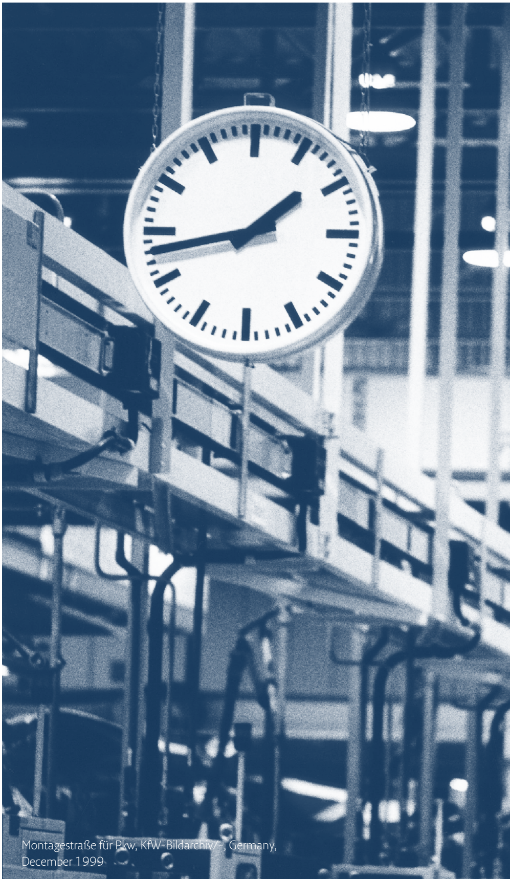
Montagestraße für Pkw, Germany, December 1999