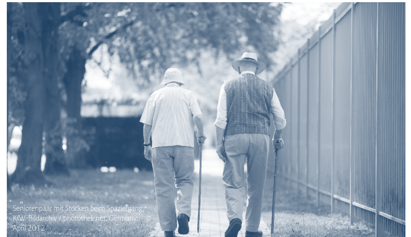
Seniorenpaar mit Stöcken beim Spaziergang, KfW-Bildarchiv / photothek.net, Germany, April 2012

Currently, solutions for instant payments at the point of interaction are regional or national and lack interoperability. The Next CMU Group therefore recommends the EU and the Member States to promote and support efforts to find a true pan-European solution.