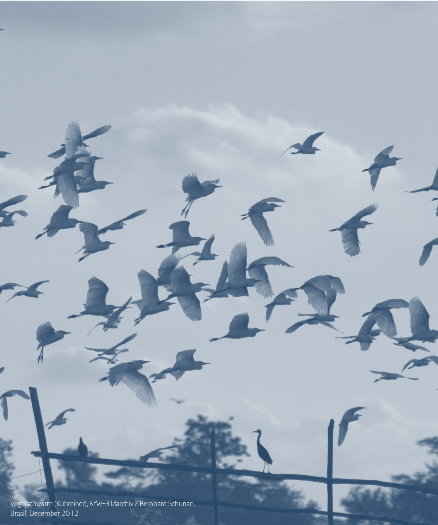
Vogelschwarm (Kuhreiher), KfW-Bildarchiv / Bernhard Schurian, Brasil, December 2012