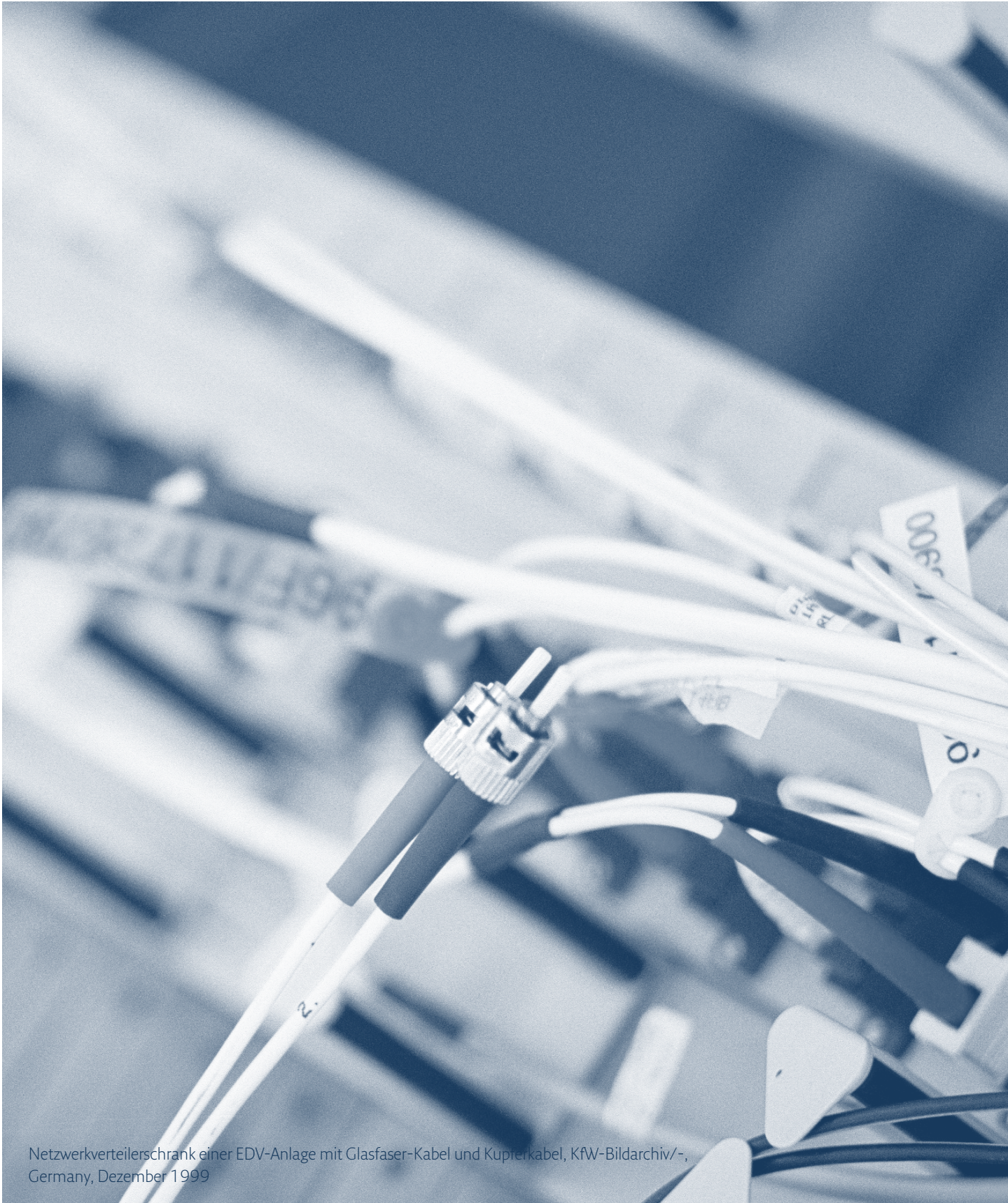
Netzwerkverteilerschrank einer EDV-Anlage mit Glasfaser-Kabel und Kupferkabel, KfW-Bildarchiv/-, Germany, Dezember 1999