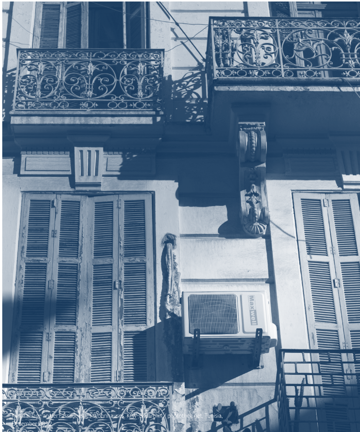
Klimaanlage an der Fassade eines Wohnhauses, Tunisia, Dezember 2012