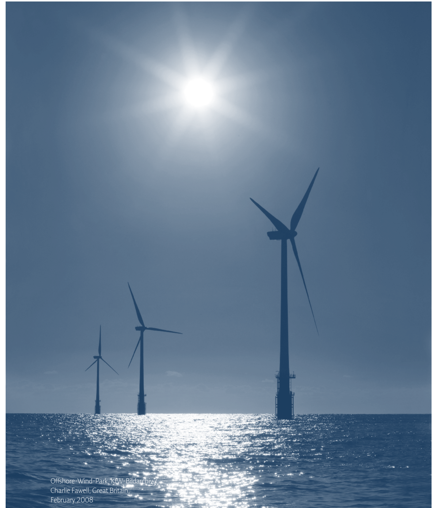
Offshore-Wind-Park, KfW-Bildarchiv / Charlie Fawell, Great Britain, February 2008

Europe already has a highly efficient and secure payment infrastructure. Digital innovations and global trends have moved the demand for retail instant payment services into focus. To avoid fragmentation of the payment market, pan-European solutions should be decisively supported. Instant payments as a new payment infrastructure within the Single Euro Payments Area (SEPA) can play a major role.