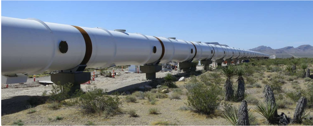
Figure 3. The 500 m long test tube of Hyperloop One in the Nevada dessert.

The main purpose of a 3 to 15 km long test track would be to get the hyperloop technologies from Technology Readiness Level (TRL) 4 to 6, up to TRL 7 or 8. It is most likely that Hyperloop One will start at TRL 6 or 7 due to the existing availability of a 500 m test track (see Figure 3). Hardt will most likely start at TRL 4 or 5 due to limited testing capabilities in the 30 m test tube at the campus of the TU Delft (Figure 4). In order to get to the final TRL 9 for the full system, a much longer test track of at least 40 km is required, depending on the maximum accelerations and decelerations of the pod. TRL 9 will need to be achieved before commercial operations can start.