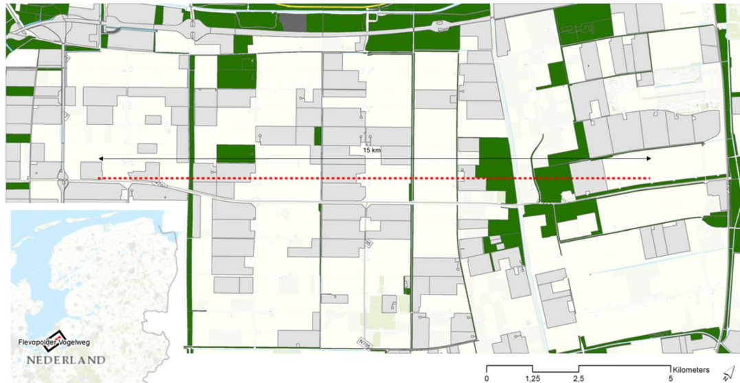
Figure 6. Search area (15 km) for 3 km test track in Flevoland

innovative businesses in the surrounding area and the potential expansion into a commercial passenger corridor. Identified uncertainties, clashes and environmental requirements and issues in this location seem solvable when addressed and mitigated in the design and stakeholder engagement strategy.