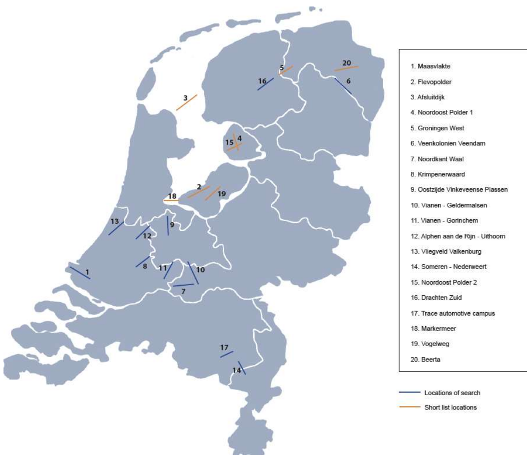
Figure 2. Potential hyperloop locations

The location analysis has been based on the earlier executed pre-feasibility study (Nov-Dec 2016). New insights on technical spatial constraints, in particular the geometrical requirements of the vertical and horizontal alignment and the radii necessary for achieving a curve on the basis of the technological analysis, have had an impact on the feasibility of spatial implementation of a test track and the choice of location. This resulted in 12 of the 17 locations from the pre-feasibility study not being considered suitable for a test track. Three new locations have been added to the list, leading to a shortlist of 8 locations. Thus in total, together with the 17 locations of the pre-feasibility study, 20 locations have been analyzed (see Figure 2).