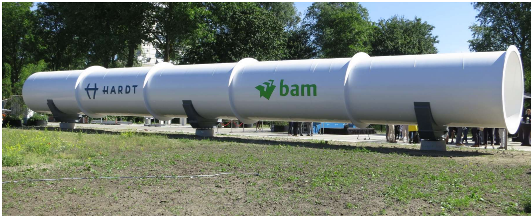
Figure 4. The 30 m test tube of Hardt at the campus of the TU-Delft.