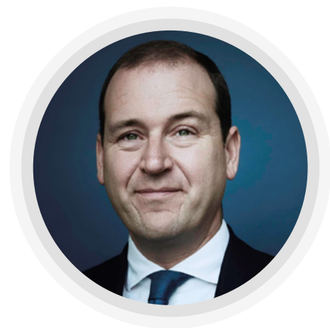
Lodewijk Asscher Special Adviser for Ukraine

Because it touches upon integration and migration, this report is also relevant for the work of Ylva Johansson, European Commissioner for Home Affairs.