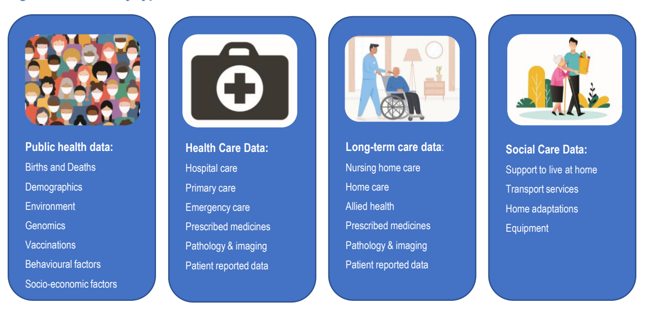
Figure 2.1. Four key types of health data in the Netherlands

Image credits: © Shutterstock.com/Moab Republic, Shutterstock.com/Cube 29, Shutterstock.com/Millering, Shutterstock.com/Qualit Design.